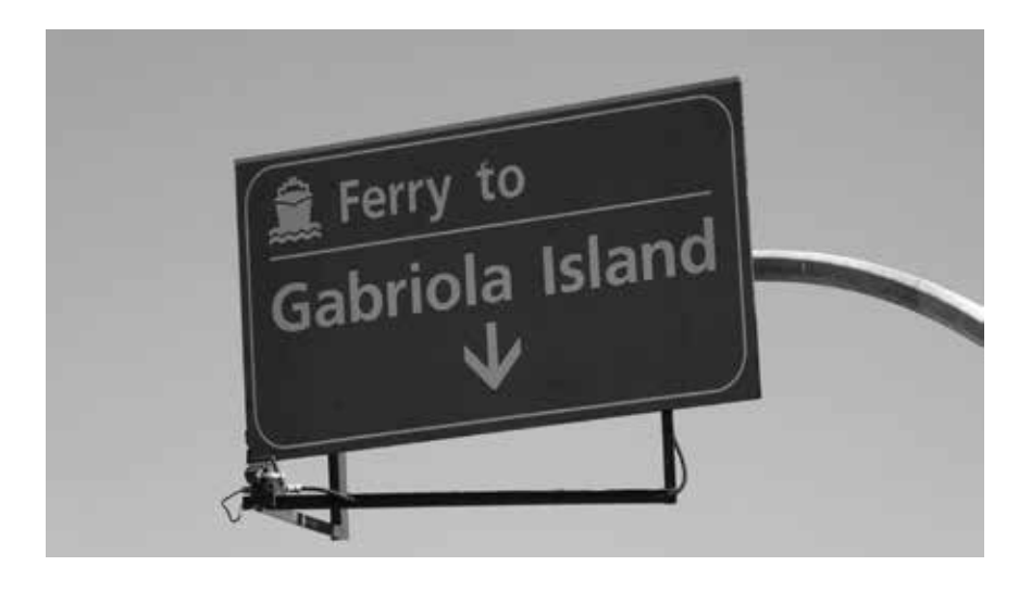
FIGURE 13.1: The 'October Ferry' manuscripts [...] show [Lowry] as a romantic who tried to express, through the magic of language, his glimpses of immortality.